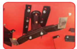
Blades with deflector guard

A fast and efficient mower for fine turf areas, HOWARD's Rollermower has three cutting heads and six overlapping fast-rotating swing-back blades.