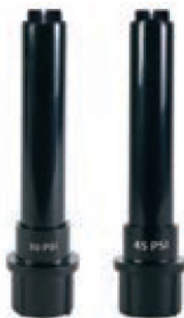
PA-8S-PRS & PA-8S-P45