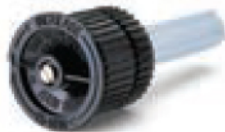
High Efficiency Variable Arc Nozzles (2.4 m, 3.0 m, 3.7 m, or 4.6 m) are available pre-installed

* The UNI-Spray accepts all Rain Bird nozzles